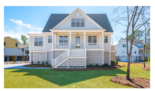
Example of similar completed home