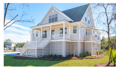
Example of similar completed home