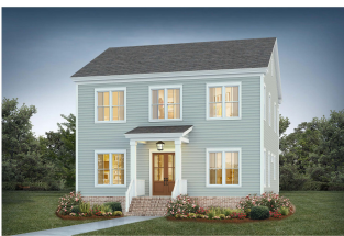
Lot 37 - Fishburne H2

Discover the allure of The Fishburne, a residence offering four bedrooms and three-and-a-half baths, providing both versatility and functionality. The owner's suite beckons with a tiled shower and a generously-sized walk-in closet, creating a retreat within your own home. Boasting remarkable spaciousness, the open-concept first floor is thoughtfully designed for entertaining