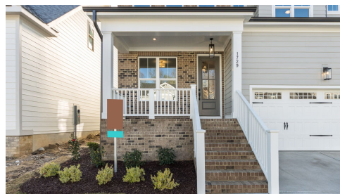
003 Front Porch