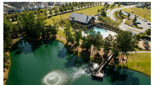
Wendell Falls Community Photos