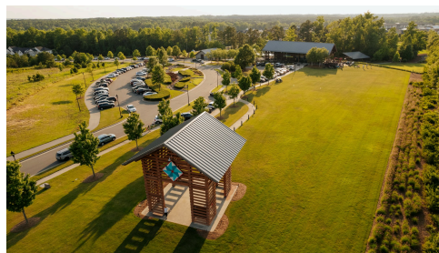
Wendell Falls Community Photos