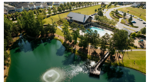
Wendell Falls Community Photos