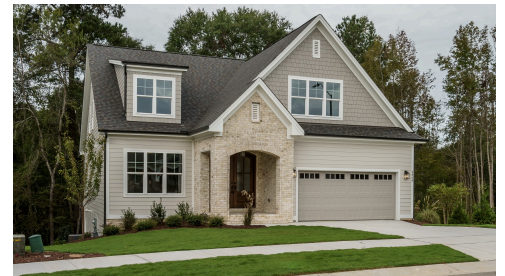
Mayfair Front Elevation