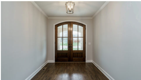
Example of Similar Completed Home

Ask about our incentive on this Mayfair Plan, built by locally owned and operated, award winning custom builder. Homes By Dickerson. We are proud to be voted the #1 Green Builder in the US.