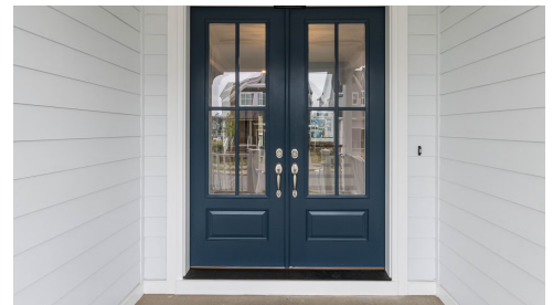
004 Front Door