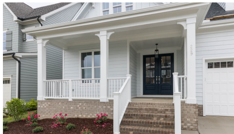
003 Front Porch