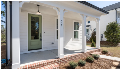
002 Covered Front Porch

Located at the cusp of downtown and horse country, Braden Place at Edgemore Heights offers the perfect balance between all that downtown offers and slower country living. With Homes by Dickerson's longstanding reputation for energy efficient, high-quality builds, we introduce: The Ashe floor plan! This spacious and timeless home boasts 2,192 square feet, with 4 bedrooms and 3.5 baths. The open floor plan and large kitchen, with a pantry, and a half bathroom make it perfect for entertaining guests or simply enjoying life comfortably. The highlight of this home is the flexibility of the space. The primary bedroom is located upstairs, complete with a walk-in closet and en suite bathroom. There are another 2 guest bedrooms upstairs, that share a jack and jill bathroom. Downstairs you will find another generously sized guest bedroom on the second floor, complete with an ensuite bathroom! In addition to the beautiful interior, the Ashe Floor plan also includes 2 porches and a detached two-car garage. Brushed Concrete Driveway, walkways, and