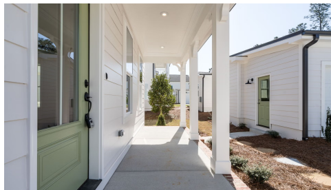
003 Covered Front Porch