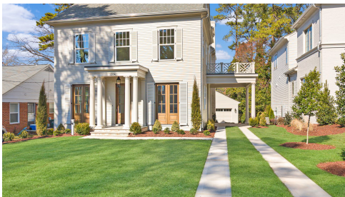
002 2304 Lyon Street

The sunlit family room, with oversized sliding glass doors and a cozy fireplace, seamlessly connects to the kitchen, creating an inviting space for gatherings. Additional main level highlights