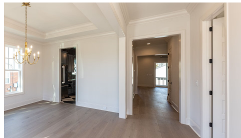
003 Foyer Entry