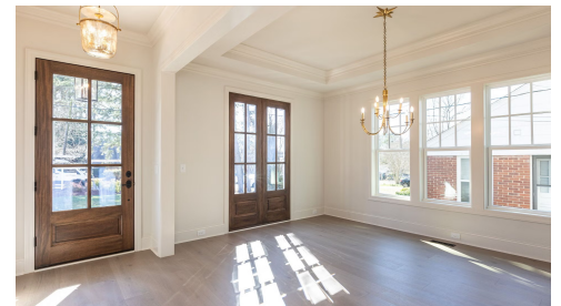
004 Foyer Dining