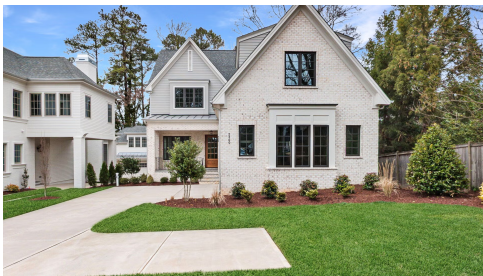
001 2300 Lyon Street

Adjacent to the kitchen, the sun-drenched family room boasts oversized sliding glass doors that frame picturesque backyard views. A cozy fireplace serves as the focal point of this inviting space,