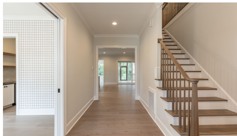
003 Foyer Entry