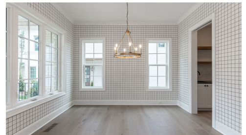
004 Dining Room