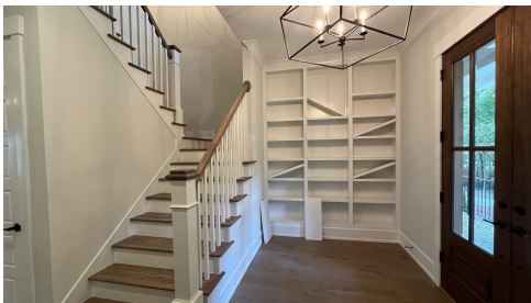
Construction Update: October 2024

Please note, photos are from a previously built Oakmont plan by Homes By Dickerson.