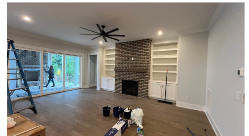
Construction Update: October 2024