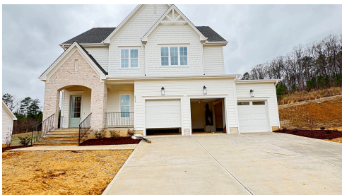
Construction Update: March 2025

Introducing the Fairfield plan, a stunning home designed for both comfort and elegance, featuring a spacious three-car garage and situated on a pool-capable lot. The main level boasts a formal dining room, an oversized breakfast nook, and a seamless slider connecting the family room to a serene