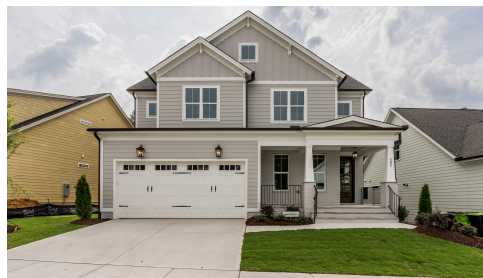
Example of completed home