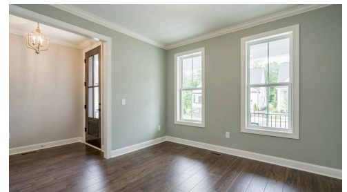
Example of completed home