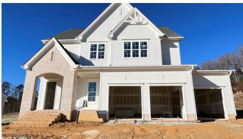
Construction Update: January 2025

Introducing the Fairfield plan, a stunning home designed for both comfort and elegance, featuring a spacious three-car garage and situated on a pool-capable lot. The main level boasts a formal dining room, an oversized breakfast nook, and a seamless slider connecting the family room to a serene