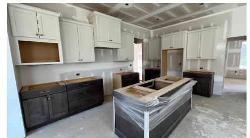
Construction Update: January 2025