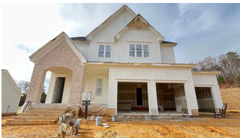
Construction Update: December 2024

Introducing the Fairfield plan, a stunning home designed for both comfort and elegance, featuring a spacious three-car garage and situated on a pool-capable lot. The main level boasts a formal dining room, an oversized breakfast nook, and a seamless slider connecting the family room to a serene