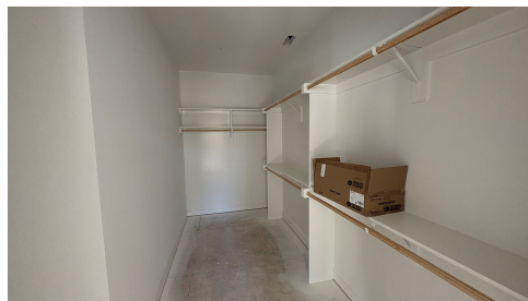
Construction Update: March 2025