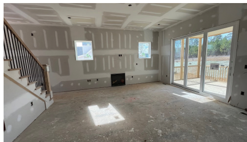
Construction Update: January 2025