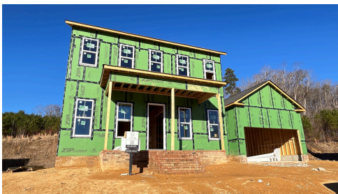
Construction Update: January 2025

Ready in February, this stunning custom home, located on a spacious .59-acre lot, offers a perfect blend of luxury and functionality. Designed with high-end finishes and energy-efficient features