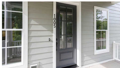
Example of completed Morris plan