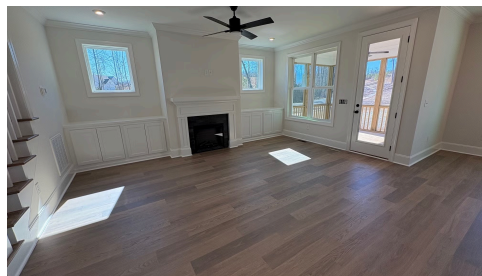
Construction Update: March 2025