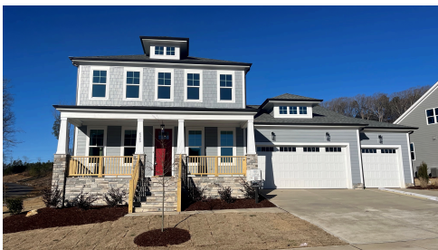
Construction Update: March 2025

Introducing the Essington Plan, a stunning home nestled on a spacious 0.45-acre homesite featuring a coveted 3-car garage. This thoughtfully designed residence boasts an owner's bedroom and a versatile dining room (or study) on the main floor, providing convenience and flexibility. The