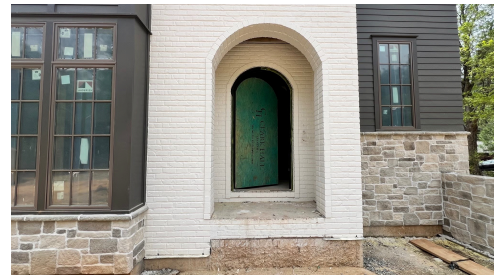
Construction Update: April 2025