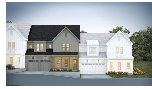
Townhome B Interior

Spanning two stories, this townhome embodies contemporary living with an open-concept design that seamlessly connects the family room, kitchen, and dining area. The spacious sunroom off the back of the home invites natural light and offers a delightful extension of the living space. The first floor is dedicated to comfort and luxury, featuring the owner's suite with a spacious walk-in closet, double vanities, and a standing fully tiled shower. Additional highlights on the first floor include a formal dining room, a laundry room, mudroom, and a powder room, ensuring both practicality and style. The second floor unveils a versatile rec room, a powder room for added convenience, two additional bedrooms, and a shared full bethroom. Ample storage is provided with a walk-in attic, and the townhome is complemented by an