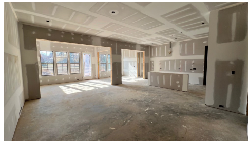
Construction Update: November 2025