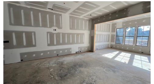
Construction Update: November 2025