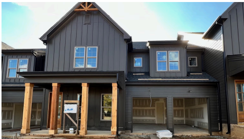
Construction Update: November 2025

Spanning two stories, this townhome embodies contemporary living with an open-concept design that seamlessly connects the family room, kitchen, and dining area. The spacious sunroom off the back of the home invites natural light and offers a delightful extension of the living space. The first floor is dedicated to comfort and luxury, featuring the owner's suite with a spacious walk-in closet, double vanities, and a standing fully tiled shower. Additional highlights on the first floor include a formal dining room, a laundry room, mudroom, and a powder room, ensuring both practicality and style. The second floor unveils a versatile rec room, a powder room for added convenience, two additional bedrooms, and a shared full bathroom. Ample storage is provided with a walk-in attic, and the townhome is complemented by an attached two-car garage. This home gives you the opportunity to collaborate with our designer and personalize the interior to fit your style. Contact us today to learn more about our design center and how to