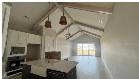
Construction Update: Dec 2024