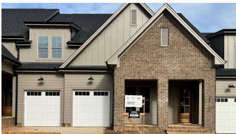
Construction Update: Dec 2024

Welcome to the epitome of modern living in this brand-new townhome nestled within the highly sought-after Croasdaile Farm community. This two-story interior townhome boasts a contemporary open concept design, with the family room, kitchen, and dining area seamlessly flowing together.