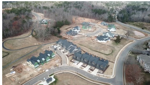
Community Construction Update: Dec 2024