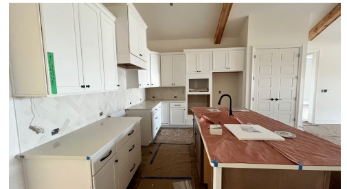
Construction Update: Dec 2024