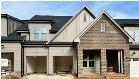
Construction Update: Dec 2024

This two-story interior townhome boasts a contemporary open-concept design, with the family room, kitchen, and dining area seamlessly flowing together. The family room extends to a spacious screened porch at the back of the home, creating an abundance of natural light and a perfect retreat