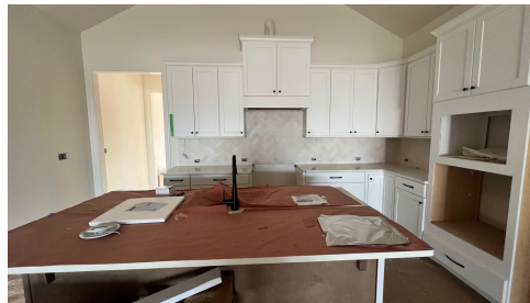
Construction Update: Dec 2024