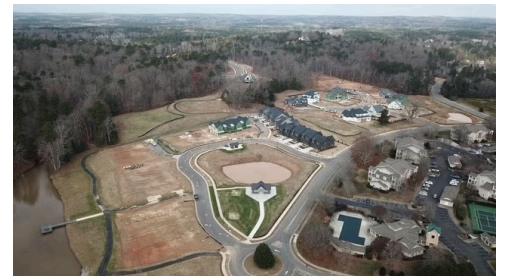
Community Construction Update: Dec 2024