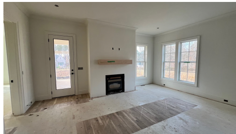
Construction Update: Dec 2024