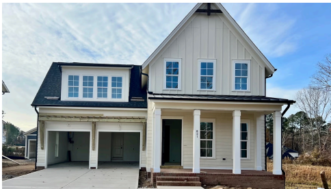
Construction Update: Dec 2024

Introducing the Markum, a stunning high-performance home located on a coveted corner lot, offering an ideal blend of luxury and functionality with 4 bedrooms and 3.5 bathrooms. As you enter, you are