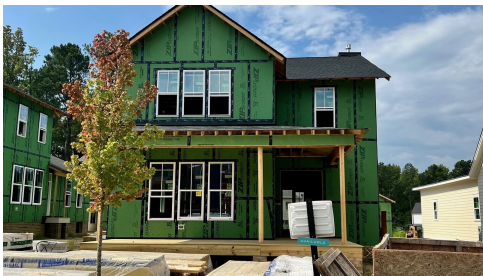
Construction Update: August 2024

Introducing the Gardner, a stunning high-performance home that perfectly combines comfort and style with its four bedrooms and three-and-a-half bathrooms. Upon entry, you're greeted by a