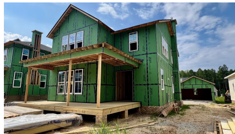
Construction Update: August 2024