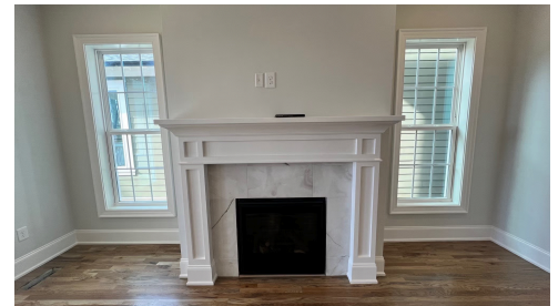
Construction Update: January 2025