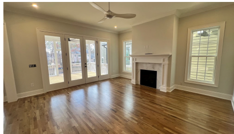
Construction Update: January 2025