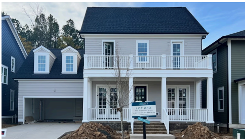
Construction Update: January 2025

Introducing the stunning Manning plan, this high-performance home offers an impressive six bedrooms and four bathrooms. perfect for families of all sizes. As you step inside, you're greeted by