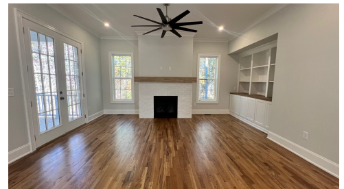
Construction Update: Nov 2024