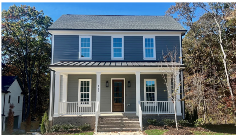
Construction Update: Nov 2024

The community's prime location offers convenient access to Duke University, Southpoint Mall,