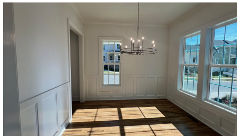
Construction Update: Nov 2024