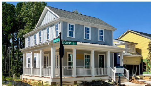
Construction Update: August 2024