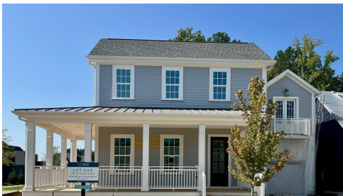
Construction Update: August 2024

Nestled on a corner homesite, the Trent welcomes you with its distinctive design and thoughtful layout. This new, custom floorplan is crafted for modern living, boasting a wrap-around front porch that sets the stage for an inviting entrance. The first floor seamlessly integrates open