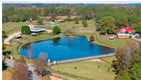
Portofino Community Photos