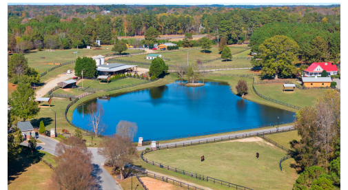
Portofino Community Photos